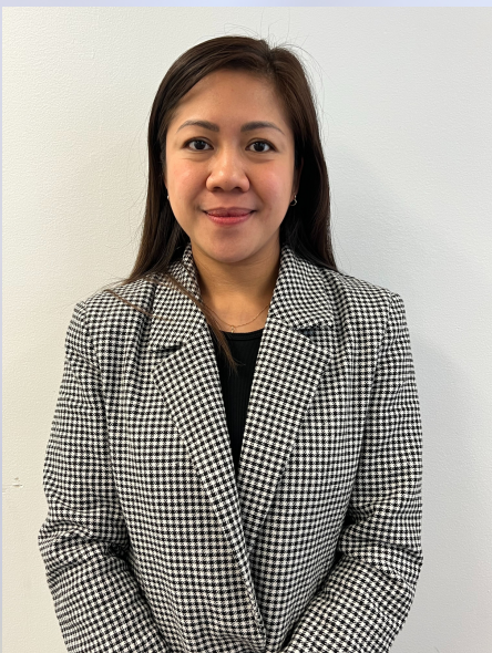
NOVA SAURA 2024 HCA GRAD

I'm grateful and proud to be part of Drake Medox College